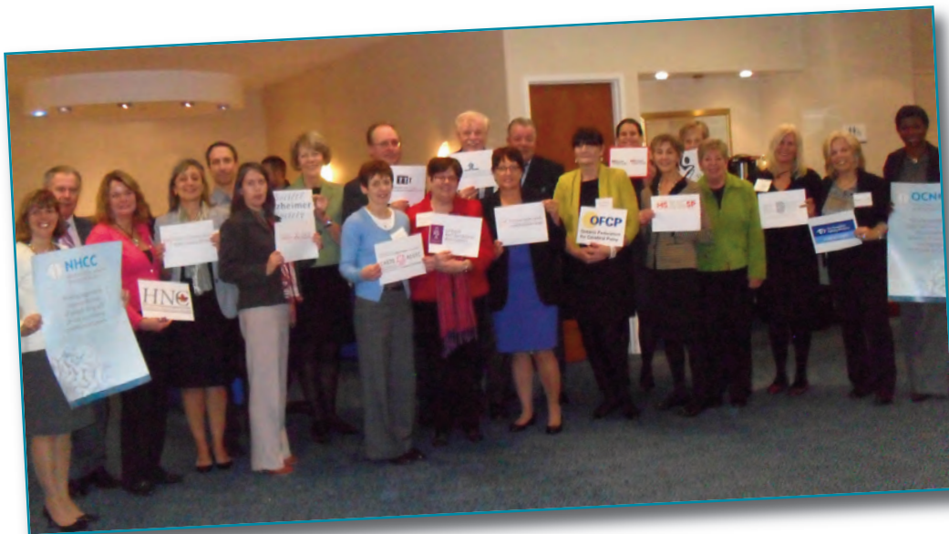
The Neurological Health Charities Canada Bi-Annual Membership Meeting on October 23, 2012

The National Population Health Study of Neurological Conditions (NPHSNC) includes three national surveys, 13 Pan Canadian research studies, the inclusion of neurological conditions as one of the groups of disorders that are tracked in the Canadian Chronic Disease Surveillance System, a Microsimulation Project, and concludes with a year-long Synthesis Process. Previous newsletters have provided extensive details about each individual project, but how do all of these components fit together? Throughout the NPHSNC, each project focused on one of four main themes: scope (which includes incidence, prevalence and comorbidities); risk factors for onset and prognostic issues; impact on quality of life and the economy; and health service utilization and gaps. While all these projects differed in methodology, they will ultimately all come together and provide a holistic view of how neurological conditions affect Canadians. However, it is important to understand the significance of each theme and what the information gathered could mean to those who are living with or are affected by a neurological condition.